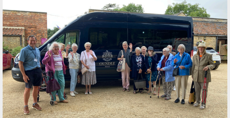
Photo of the Summer minibus trip to Bosworth's Garden Centre